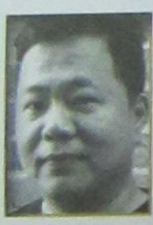
DIZI / XIAO