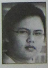
SHENG / SUONA KEYBOARD