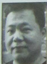
DIZI / XIAO